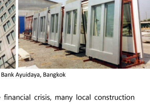
market itself to faraway places such as the Middle East. Being a specialist, it was relatively easy for LWC to market its services and products in the Middle East. Together with the main contractors, LWC participated in a number of prestigious projects such as the Emir's Private Terminal of the Doha International Airport and the College of Technology in Qatar.